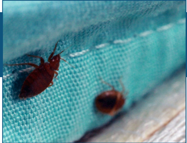
Bed bugs are one of the most difficult to control household pests. Finding a competent professional is critical in eliminating bed bugs from your home.