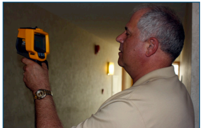
A pest management professional checks his infrared thermometer, used to check rooms for cold spots during heat treatments for bed bugs.

The most important qualities for a bed bug control provider are experience and a record of controlling these pests in situations similar to yours. Apartment managers and tenants should look for someone with experience treating multifamily housing. Hotel managers should select a provider with experience controlling bed bugs in the hospitality industry.